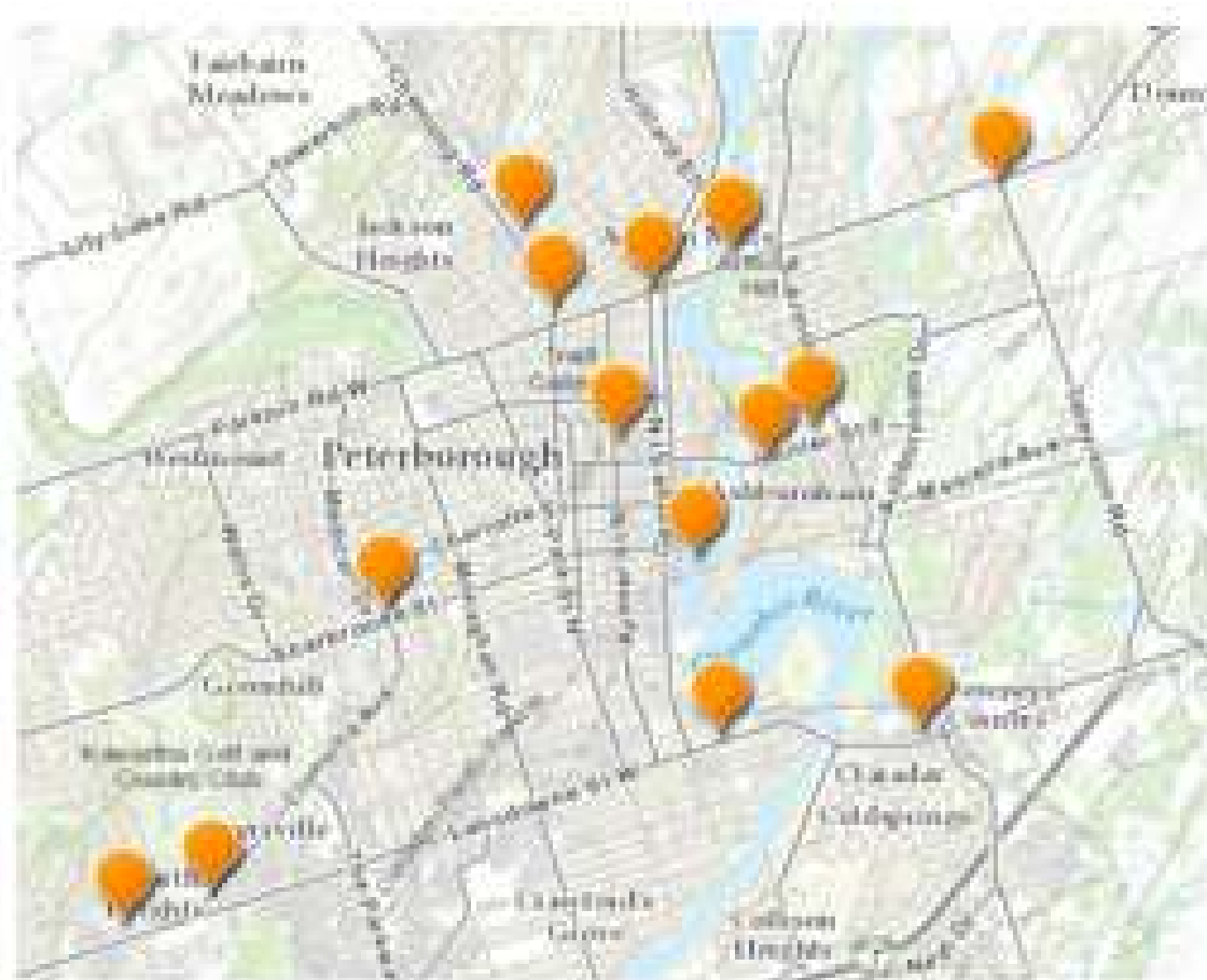
Figure 1: Jake's House Textile Drop Box Locations