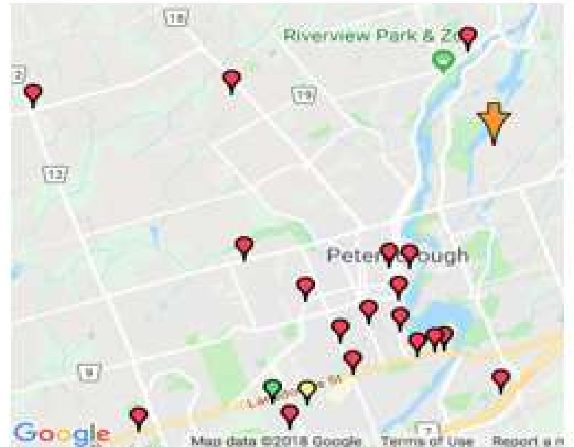
Figure 2: Diabetes Canada Drop Box Locations